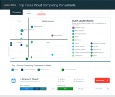
Kinetech Cloud - #1 Cloud Consultant in Texas

Kinetech remains at the forefront of the merging between the physical and virtual worlds and sees the relevance of our software products and services growing well into the future. Technology unemployment is near record lows (1.9%) while the demand for application development continues to outpace the supply of qualified developers. Demand is expected to increase 5x in the coming years.